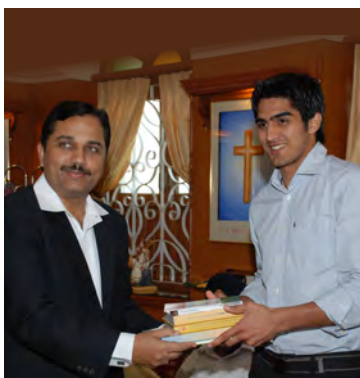
Padma Shri Vijender Singh Olympic Bronze Medalist, Boxing