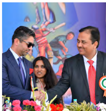
Padma Bhushan Abhinav Bindra Olympic Gold Medalist, Shooting