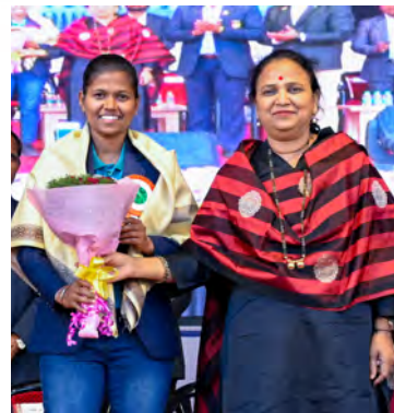
Ms. Poorna Malavath Youngest female to Summit Mount Everest