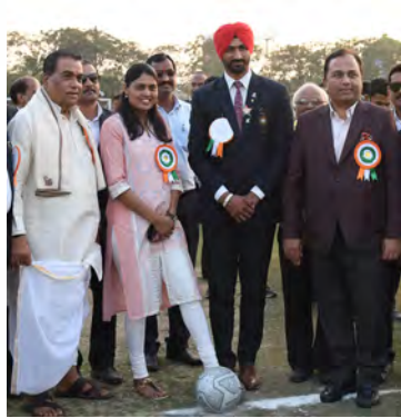
Ms. Lalita Babar Arjuna Awardee, Athletics