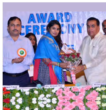
Padma Shri Mithali Raj Arjuna Awardee, Cricket