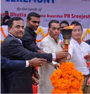
Padma Bhushan Baichung Bhutia Indian Football Team Captain