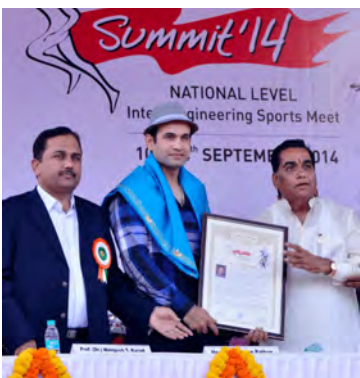
Mr. Irfan Pathan Former Indian Cricketer