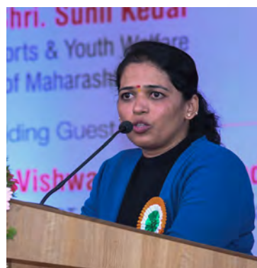
Ms. Tejaswini Sawant Arjuna Awardee, Shooting