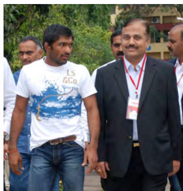
Padma Shri Yogeshwar Datt Olympic Bronze Medalist, Wrestling