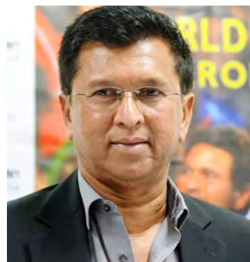
Mr. Kiran More Arjuna Awardee, Cricket