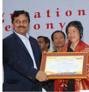
Padma Vibhushan M. C. Mary Com Olympic Bronze Medalist, Boxing