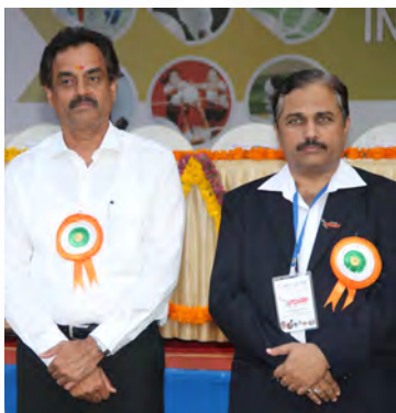
Padma Shri Dilip Vengsarkar Former Indian Cricketer