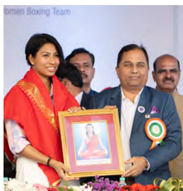
Ms. Lovlina Borgohain Arjuna Awardee, Olympic Bronze Medalist, Boxing