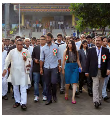
Padma Shri Cheteshwar Pujara Arjuna Awardee, Cricket