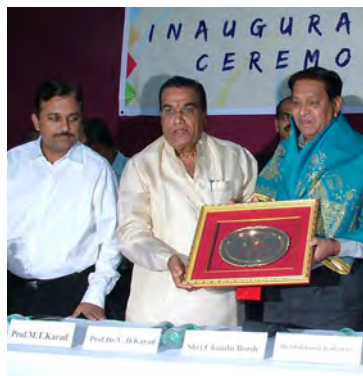
Padma Bhushan Chandu Borde Former Indian Cricketer