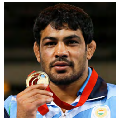
Padma Shri Sushil Kumar Olympic Silver Medalist, Wrestling