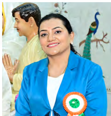
Padma Shri Shital Mahajan Skydiver