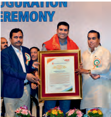
Padma Shri V. V. S Laxman Arjuna Awardee, Cricket